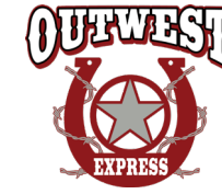
OutWest Express, LLC Member Since 2015