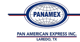
Pan American Express, Inc. Member Since 2010