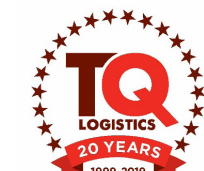
TQ Logistics, Inc. Member Since 2011